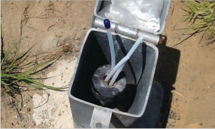
CMT Multilevel System with Dedicated Sample Tubing