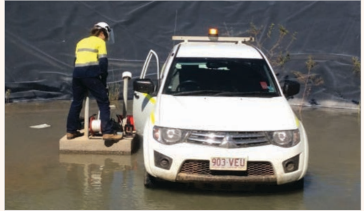
Sampling a Groundwater Well Surrounded by Flood Water

Biannual sampling of the CMT Multilevel Systems is done using small diameter footvalves and PTFE tubing. Separate tubing is left dedicated in each of the channels. The Solinst 102 Narrow Cable Water Level Meter is used to measure depth to water in each of the CMT channels.