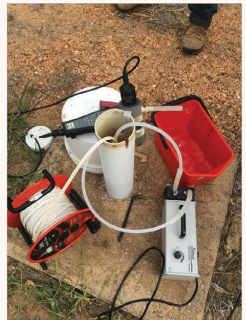
Groundwater Sampling Setup Using Solinst Peristaltic Pump and Interface Meter

Many of the wells are sampled using Solinst Peristaltic Pumps and depths measured using Solinst Interface Meters. Some of the deeper wells are sampled using low flow micro-purge methods. Equipment used includes Solinst 101 Water Level Meters, Tag Lines, Bladder Pumps and the Electronic Pump Control Units.