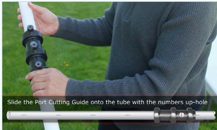
Slide the Port Cutting Guide onto the tube with the numbers up-hole

Solinst holds training sessions at our headquarters in Georgetown, Ontario Canada, as well as at conference and trade show events; Solinst staff also travel to drillers’ facilities to provide instruction. In some states, these training courses can qualify for continuing education credits.