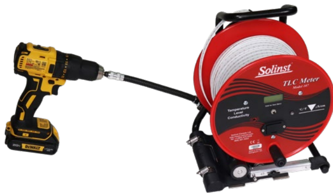
Solinst TLC Meter with Power Winder Installed to Make Temperature and Conductivity Profiling Applications Easier