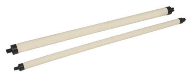
Replaceable Bladder Cartridges

The compressor uses a 12-volt DC power source, such as a car or truck battery, and comes with alligator clips. It operates at up to 150 psi and is equipped with a 2 US gallon (7.6 L) air tank rated to 175 psi.