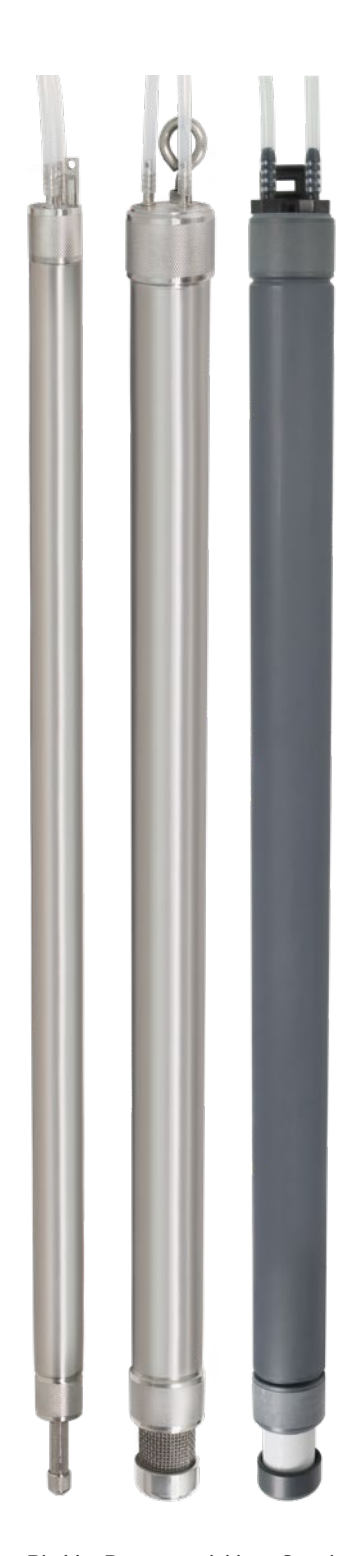
Solinst Bladder Pumps available in Stainless Steel 1" and 1.66" (25 mm and 42 mm) and PVC 1.66" (42 mm)

Portable Bladder Pumps are supplied on a free-standing reel. The rugged systems are very convenient and easy to transport. The barb and compression tubing fittings on the reels and controller allow quick set-up in the field. Use a Solinst Model 103 Tag Line to lower and support the pump in the well (see Model 103 Data Sheet).