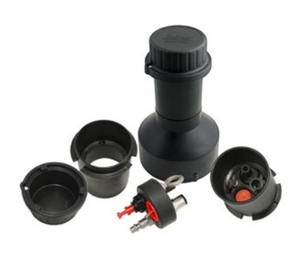
Well Caps for Dedicated Bladder Pumps