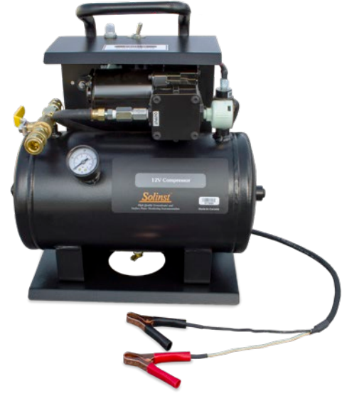
12 Volt Compressor

These convenient Controllers are rugged, dependable, and suitable for all environments. Quick-connect fittings allow instant attachment to dedicated well caps, portable reel units, and an air compressor or compressed gas source.