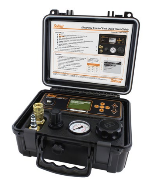
Model 464 Electronic Control Unit (125 psi and 250 psi Models)

An advantage of the Bladder Pump is the ability to also use it without a bladder. This allows you to continue sampling if you are in the field with no bladder replacements. Simply operate it like a Double Valve Pump (DVP).