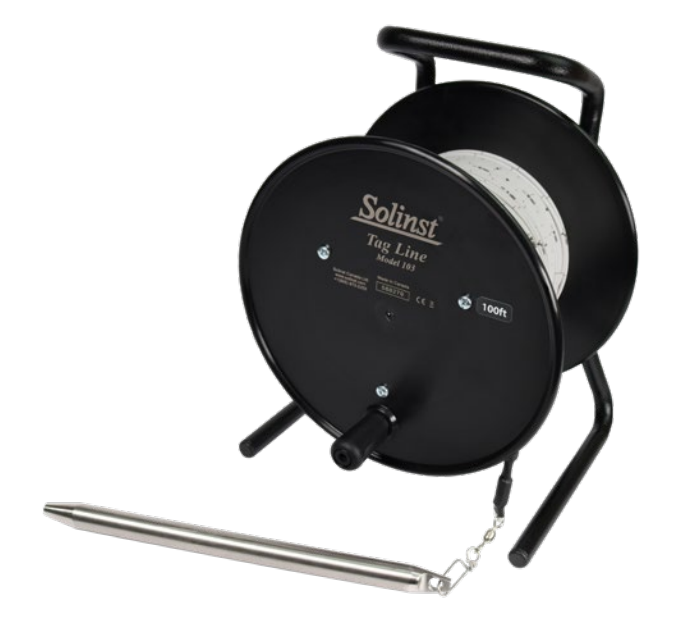
Tag Line / Suspension Cable