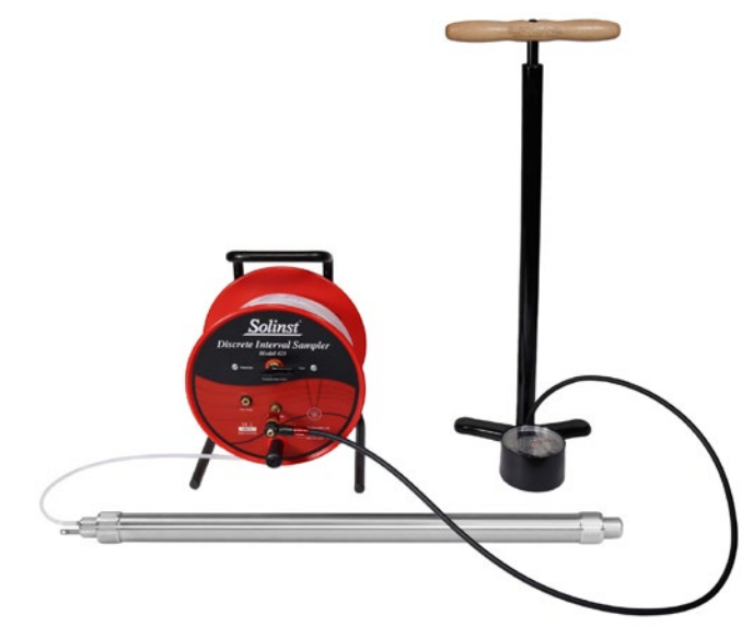
1.66"ø Discrete Interval Sampler with High Pressure Hand Pump