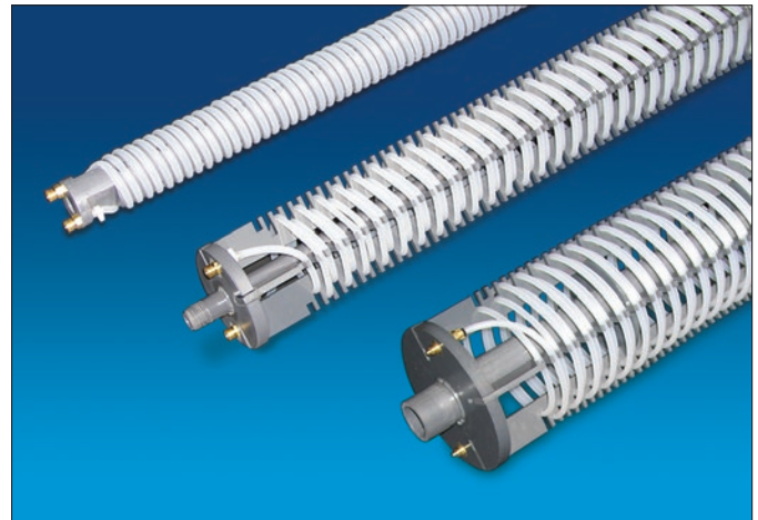
1.8", 3.8" & 5.8" Waterloo Emitters