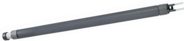
Solinst Model 407 1.66" dia. PVC Bladder Pump