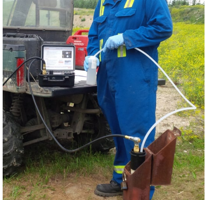
Dedicated Bladder Pump Operation

Although there may be a high initial capital investment, the bladder pump will pay for itself through time savings and defensible data. The controller is only purchased once, and can be re-used on numerous sites and sampling applications. The air supply can be rented inexpensively. Dedication of customized, pre-assembled systems significantly reduce the time needed in the field for setup. If portable pumps are required, then pumps are easily disassembled for decontamination between sampling events.