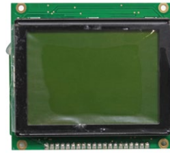
464 Mk3 125 psi Controller Board Assembly (#113900)