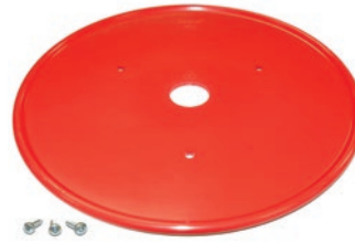
Red for all other Models

Note: Model 122 Interface Meters will have an additional washer over the centre rod that is connected to the ground cable. Remove this washer as well.