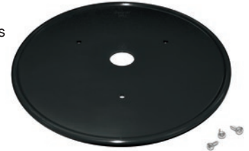
Black for Models 102 and 103