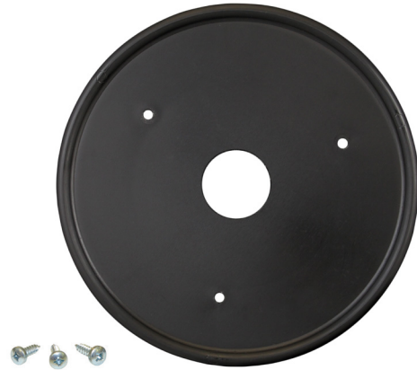
122M SC100 Mini Backplate Assembly